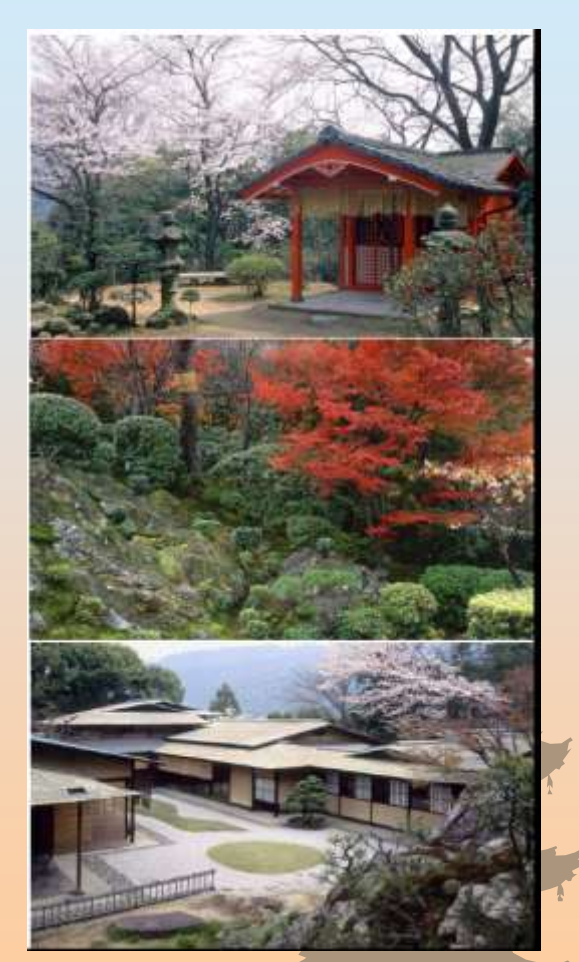
Garden in hotel