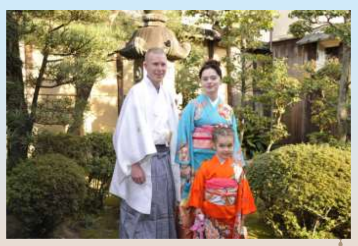
Dressing - Kimono