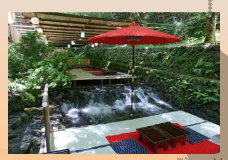
Cool down near river - Kawadoko 14

PHYSOR2014, Kyoto, Japan Sep.28-Oct.3, 2014