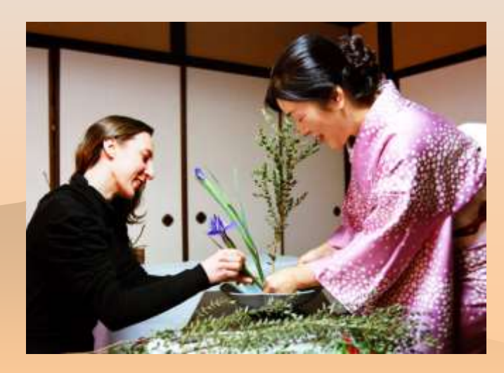
Flower arrangement - Ikebana