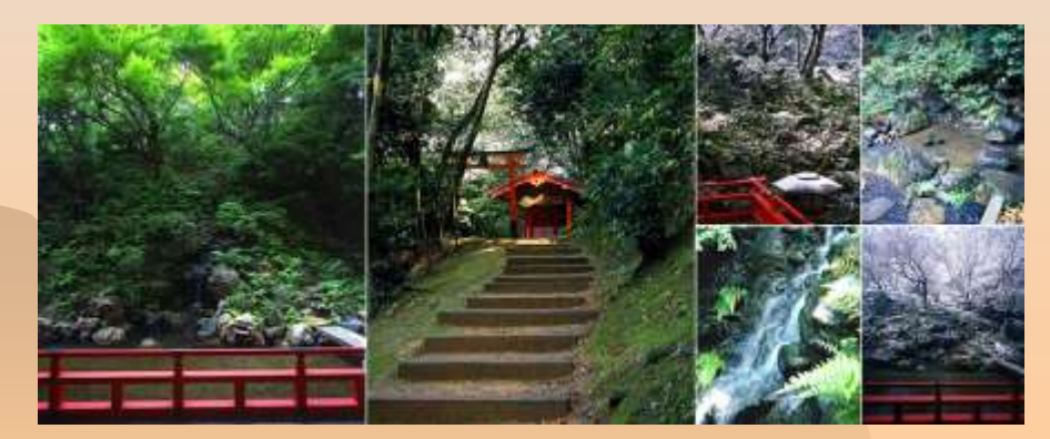
Japanese garden in the hotel